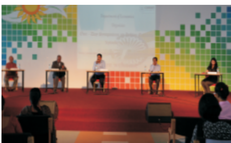
One day symposium on budget