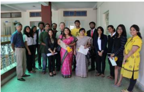
Panel discussion with Amnesty International

The course involves activities such as case discussions, journal clubs, paper presentations, student seminars, interaction with industries, skill development programs for analytic tools and interpersonal skills which makes it unparalleled as compared to the industry standards.