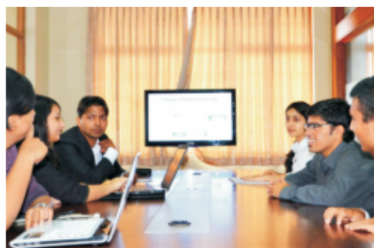
Center for Advanced Research and Training